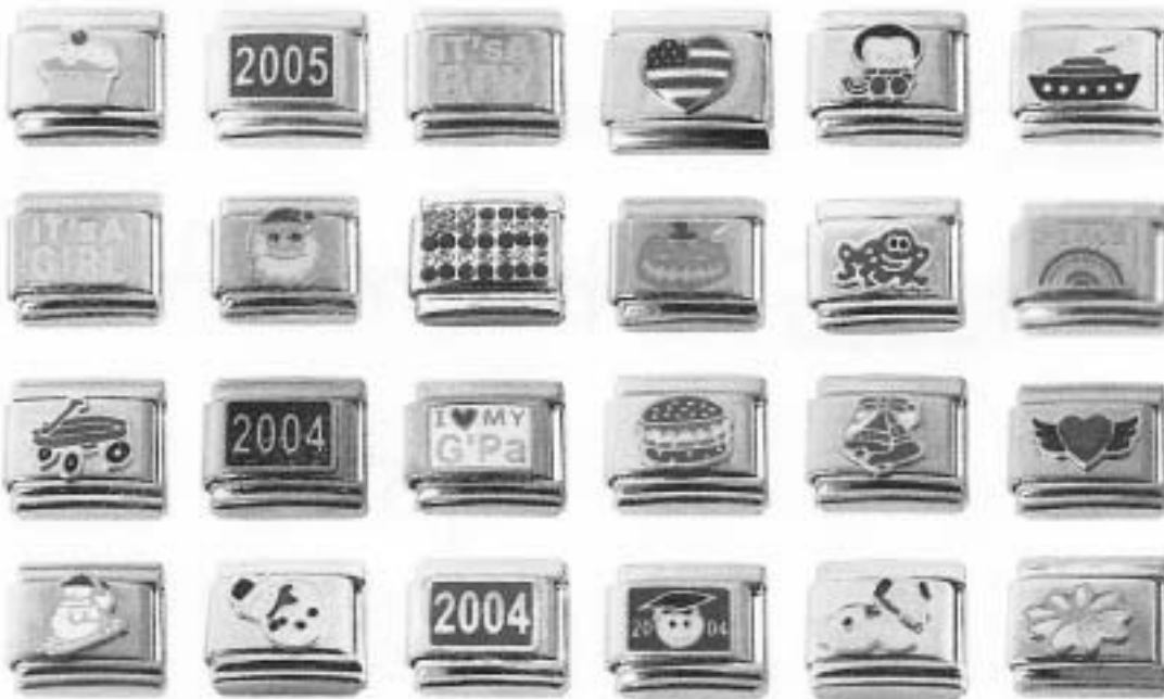
A sampling of charms for bracelets from Italy.

• Periodically spot check charms to ensure that they are securely fastened.