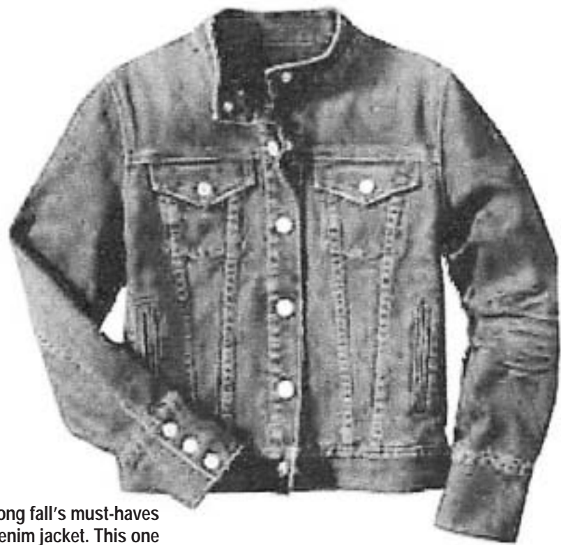
Among fall's must-haves is a denim jacket. This one in black-wash denim from GAP.

MERCER County Community College www.mccc.edu